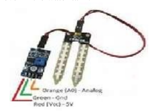
Fig 3.2.1: Soil Moisture Sensor